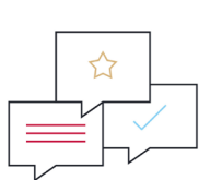
Strategy & Planning

Ultima is only one of a few certified Microsoft partners in the UK qualified to offer end-to-end IT services. Our continued focus is on the provision of quality and complementary technical and strategic services, delivered across each of the following mature practice areas.